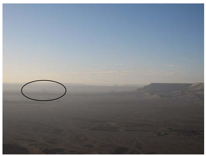
Fig. 2. Environment of Monastery of St. Samuel. It is located in the midst of the Western Desert. The circled area is where the monastery is. The photo was taken by the author on December 20 2009.

Today most of the monasteries in Egypt are surrounded by the desert. Figure 1 shows the locations of the monasteries in Egypt. It tells us that the monasteries are not right beside the River Nile as most of the cities are but they are located at least twenty to thirty kilometers away from the Nile. It means they are at the midst of the desert or at the border between the human habitation and the desert. In this paper, Monastery of St. Samuel (dayr anbā ṣamū'īl) in Upper Egypt is discussed as a case study to investigate the significance and the role of the desert in the Coptic Christianity.