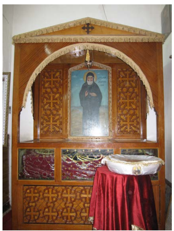
Fig. 3. Icon and relics of St. Samuel. The body of St. Samuel has been kept in the monastery as holy relics.