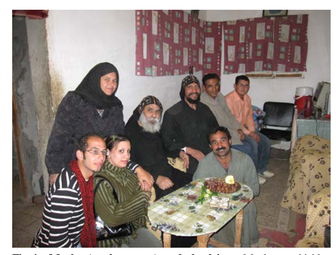
Fig. 4. Monks (at the center) and the laity. Monks are highly respected by the laity. Many lay believers visit Monastery of St. Samuel despite of its location in the midst of the desert.

Monastery of St. Samuel has also been famous since the former Patriarch Kyrillos VI (papacy 1959-1971) and the present Patriarch Shenouda III (papacy 1971-) had once been