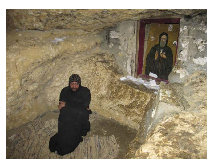
Fig. 5. A cell for the monk. Monks of Monastery of St. Samuel spend days and weeks in the caves near the monastery to devote themselves to the God.

Basilius as opposed to some other monasteries where monks talks on their own mobiles. In this sense and because of its location in the middle of the desert, the monks of Monastery of St. Samuel are more kept away from the secular world than the other monasteries. However they say it is good for them.